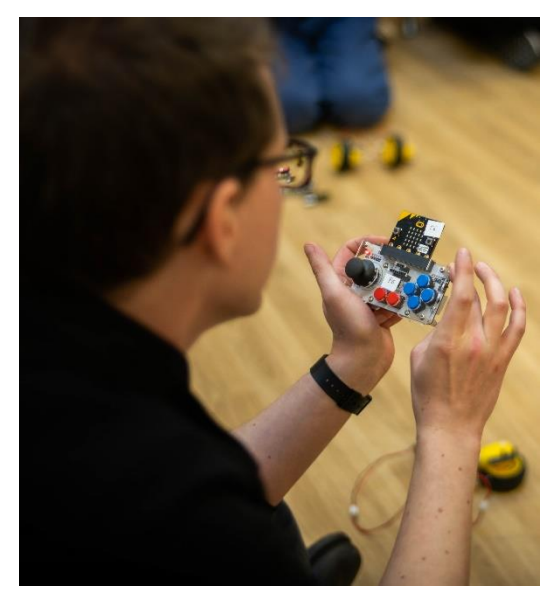
Get Digital: Model Box Stories (11-13yrs) – Saturday 26<sup>th</sup> September, 10am – 3pm

You'll devise a short story in pairs, and then design and build a model box theatre set to bring it to life! You'll be creating sound effects, programming LED lights and using motors to create motion — and there'll be the chance to share your story with each other at the end of the day.